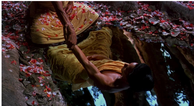
Рис. : Still from the film "Little Buddha"