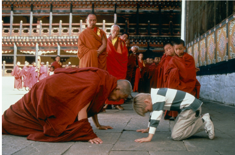
Рис. : Still from the film "Little Buddha"